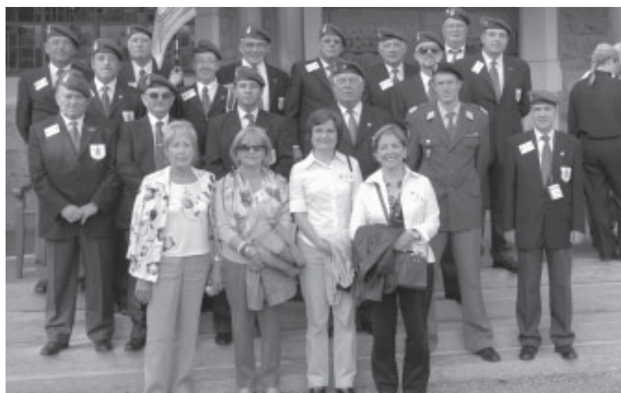
The Spanish Delegation to the XXI IFMS Congress.