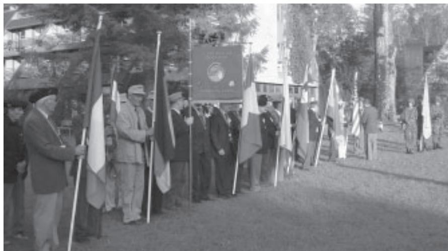
Opening ceremony of XXI Congress of the International Federation of Mountain Soldiers (IFMS) at Gwatt, Switzerland. Delegates of the eight member nations displayed their flags as a band played each country's national anthem.