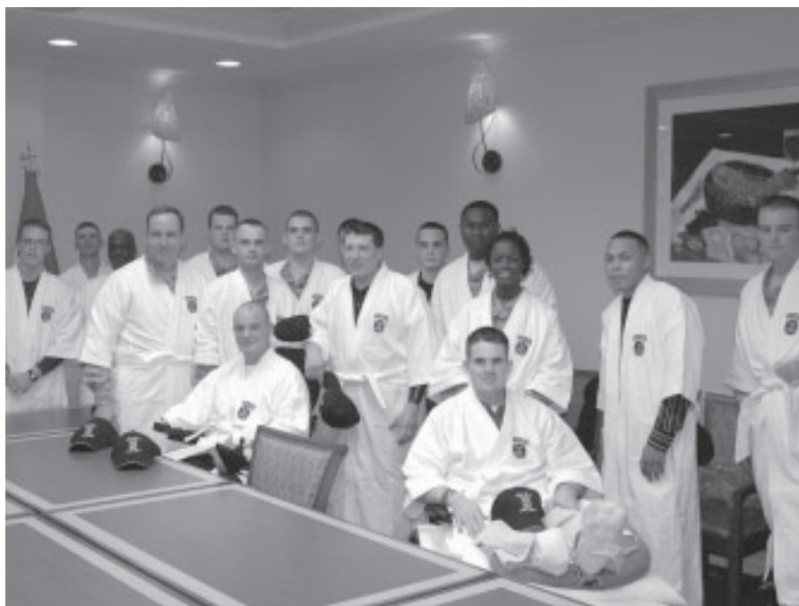
Soldiers recovering from wounds at Walter Reed Army Medical Center proudly wear their 10th Mountain Division "Climb to Glory" Robes.