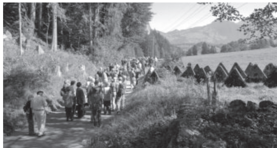
A tour of Switzerland's World War II mountain defense line, showing the concrete triangular barriers erected on the four borders of Switzerland to avoid motorized armor invasions during the European conflict.