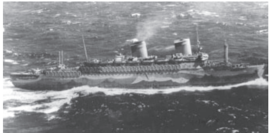
The U.S.S. West Point in 1944. Note how the camouflage paint job blends into the wake.

The bow section for years has defiantly stood against the elements but as recently as April 2007 the starboard side collapsed. The remainder of the ship is slowly sinking and falling into the Atlantic. Despite the towing disaster, the ship may have been given an extension of life. No one will ever know if the American Star would have survived the devastating tsunami off the coast of Phuket on December 26, 2004 where it was to be anchored. While some may see this as an ignoble end to a great ship, others may find comfort knowing the fine ship that was once the USS West Point avoided the scrap yards and rests at home in waters where she performed her most important missions, quietly living out her final days.