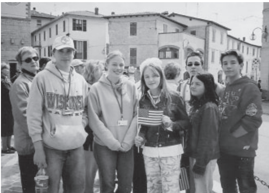
American and Italian students meet during the 2006 Sempre Italia tour.

Fabrizio Giannozzi, Florence USA Consulate